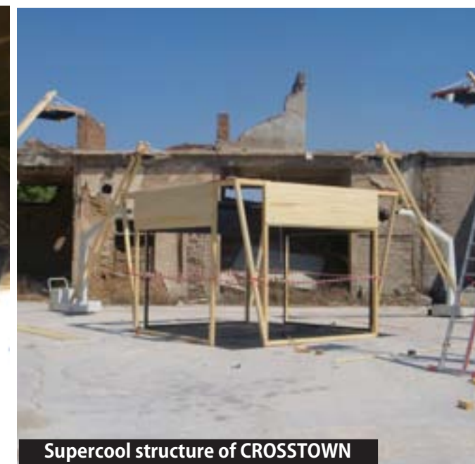
Supercool structure of CROSSTOWN