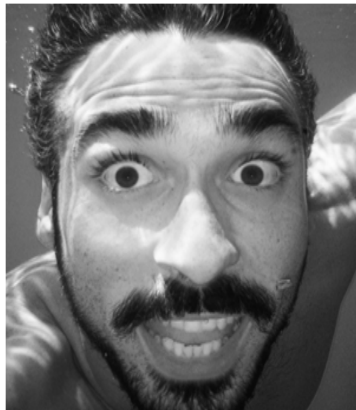
Dade from Italy under the water in Nafplio