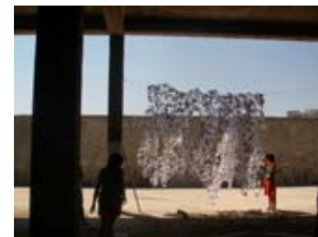
Structures in the wind