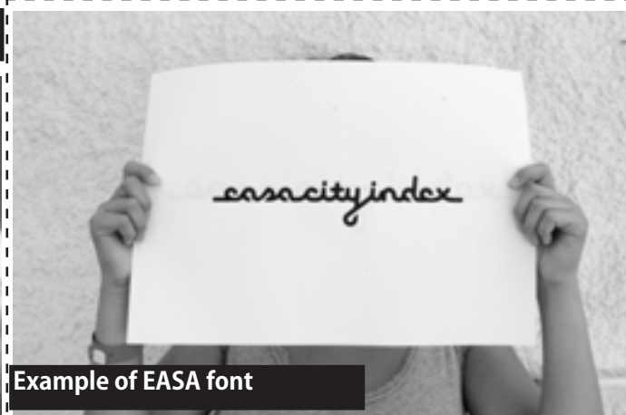
Example of EASA font