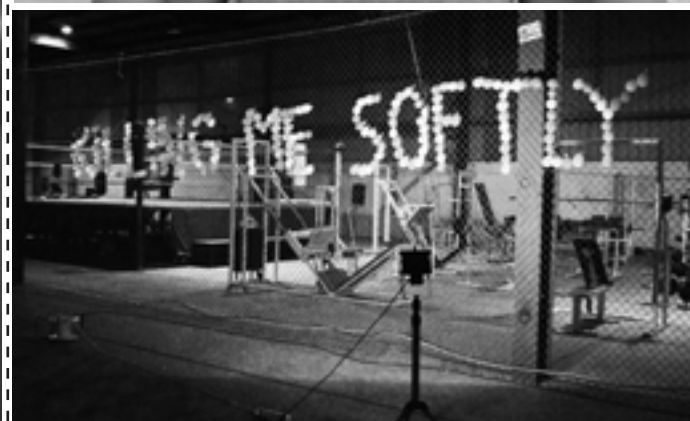
Killing me softly with typography