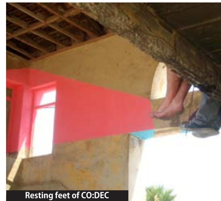
Resting feet of CO:DEC